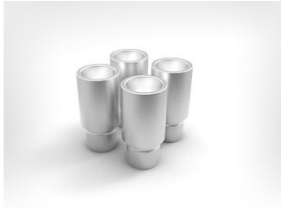
FHB3000-LA02 4 extension tubes, 100 mm