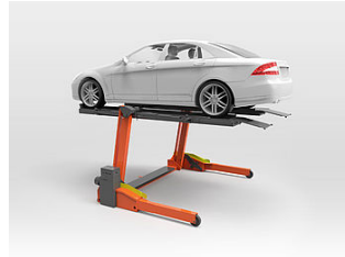
FHB3000-FA3-2300 2 platforms, 2.75 t, length 3.5 m, to drive-on with cars