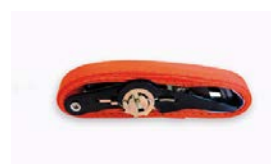
Lashing straps (2 units)