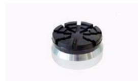
Height adapter 44 mm