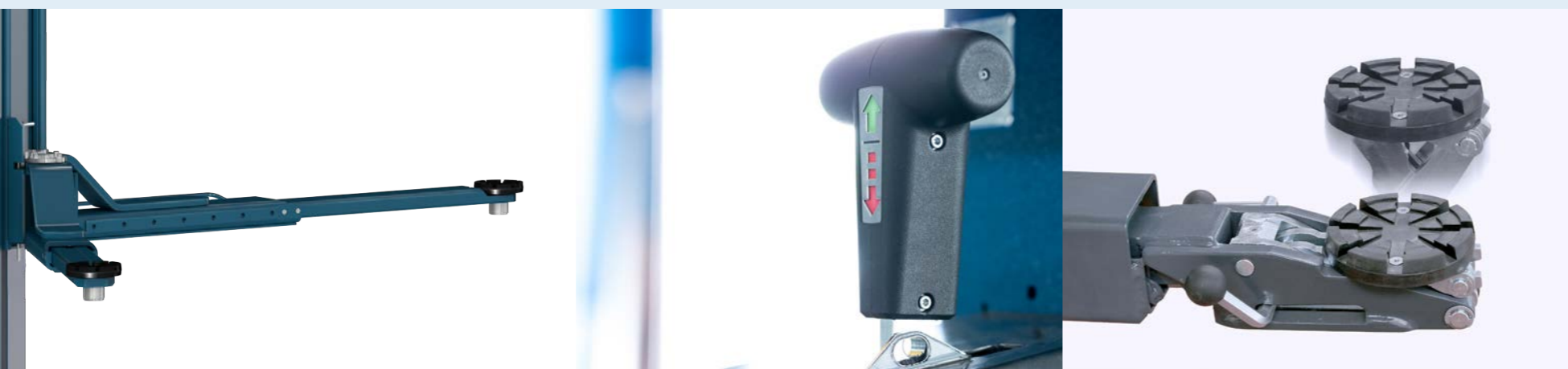
SC (Sports car arms): extremely flat construction. Very sturdy, made of solid material. Especially suitable for very low and wide sports cars.