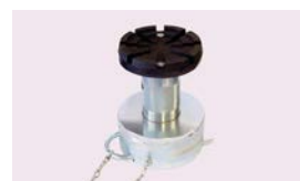
Height adapter 155-245 mm