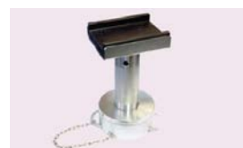
U-form adapter 150-233 mm