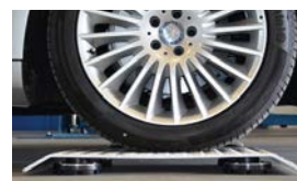
Drive-on plates (4 units)