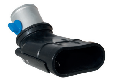
AM 200 AMS 200