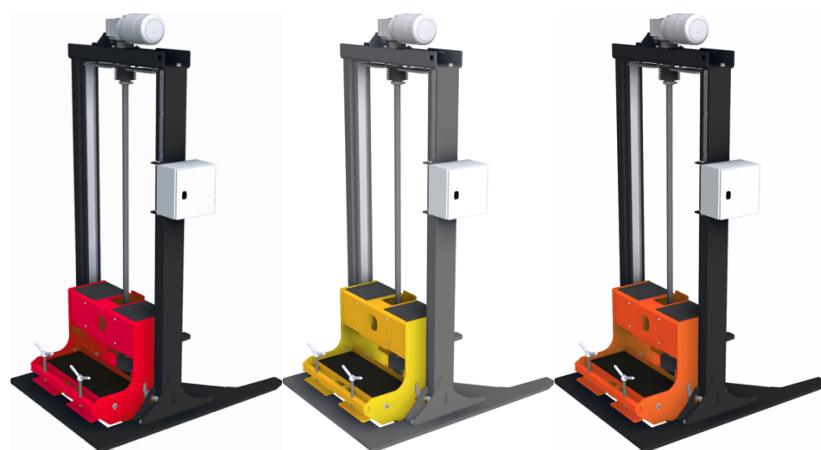
Examples of custom colours