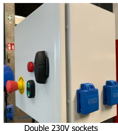
Double 230V sockets