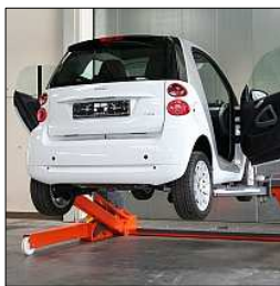
Free access, doors can be opened, no columns