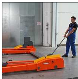
Easily manoeuvrable by one person