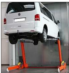
Version FHB3000-SL also suitable for vans