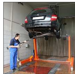
Option: Use for washing