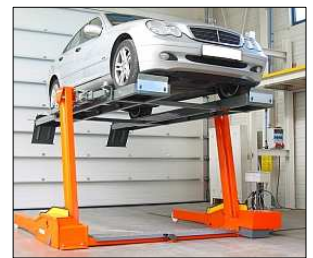
Accessory: platforms, capacity 2.75 t