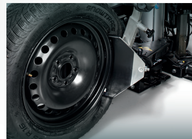
On floor bead breaker *