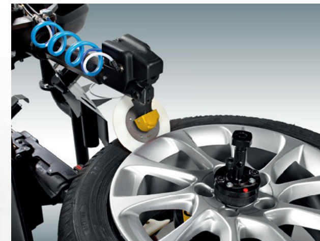
Dynamic bead breaker