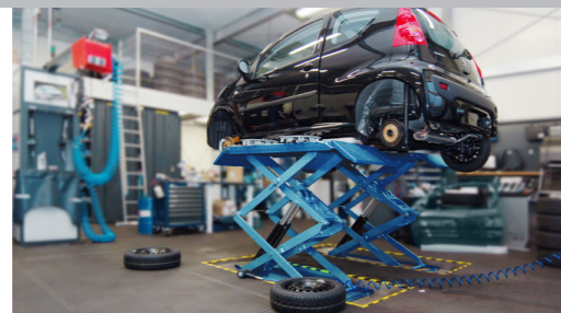
JUMBO LIFT 3200 NT – for vehicles up to VW T4 with short wheel base and similar vehicles | Optional in-ground and above-ground installation