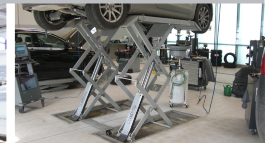
JUMBO LIFT 4000 NT – for vehicles up to VW T5 with short wheel base and similar vehicles | In-ground installation