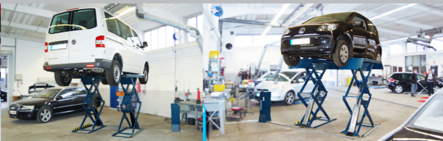
JUMBO LIFT 3500 NT – for vehicles up to VW T5 with short wheel base and similar vehicles | Optional in-ground and above-ground installation