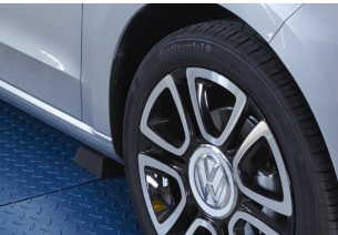
Accessories: truncated pyramid pad