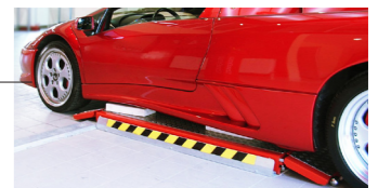
Special color extra charge