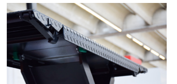
Flaps to increase the length of the ramps, easy to lock and unlock with one hand