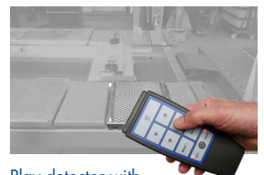
Play detector with remote control