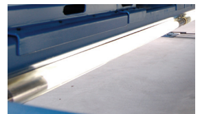
Lighting 4 or 6 tubes, fluorescent or LED