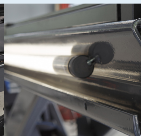
PLUS AMS VERSION (above ground installation): with wheel free lift + wheel alignment set + optional Axle Jack