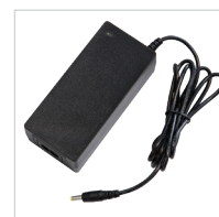
230 V AC adapter with charging cable