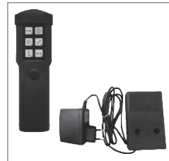
Lamp and charging station